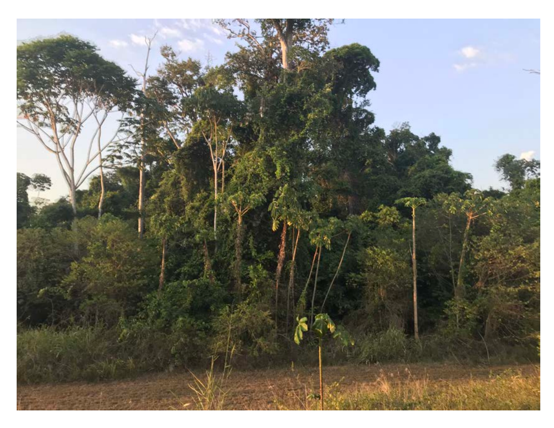
DXPEDITION TO RIO CAPIM, NORTHERN BRAZIL WITH THE BONITO MEGALOOP FX ANTENNA

Hi there, I returned from my 4<sup>th</sup> trip to the very beautiful, if rather rugged Rio Capim area of Northern Brazil, just before Christmas. As usual, this was a business trip, but of course I always take the opportunity to DX when I'm travelling. Spending yet another month out in the jungle presented the usual problems with heat, tropical bugs and at this time of year, much precipitation, particularly in the afternoons and evenings. There are also problems with the dreaded local QRM. Even in the remotest of locations, if humans are present and using electricity, there is noise. At my temporary, tropical QTH, the lighting systems in particular generated a huge amount of noise. In the evenings, the noise floor on my SDRPlay RSP DUO with a longwire would be terribly high – sometimes around -95 dBs. This was totally unworkable of course with a standard telescopic antenna, or indeed, with any type of wire extension.